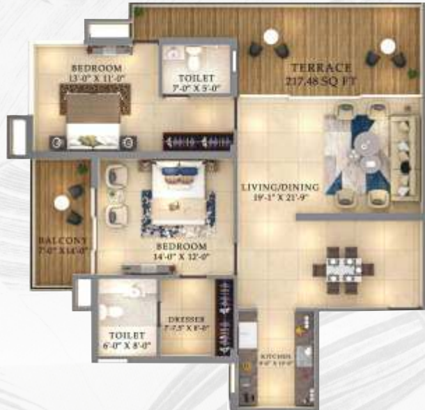
Unit Type 4 Total Area: 1615.44 sq. ft. Built-up Area: 1300 sq. ft. 2 BHK