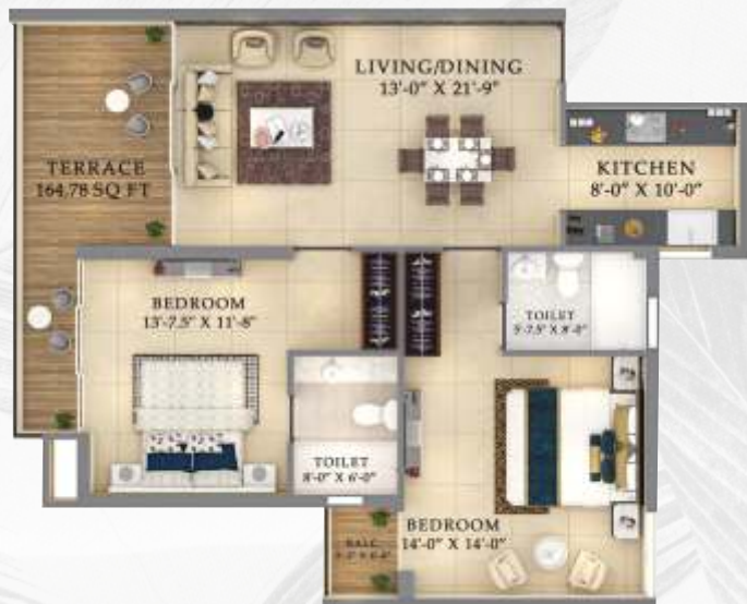
Unit Type 6 Total Area: 1374.29 sq. ft. Built-up Area: 1125 sq. ft. 2 BHK