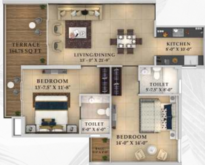
Unit Type 2 Total Area: 1350.84 sq. ft. Built-up Area: 1109 sq. ft. 2 BHK