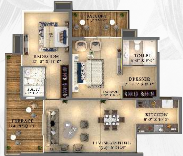
Unit Type 5 Total Area: 1440.33 sq. ft. Built-up Area: 1158 sq. ft. 2 BHK