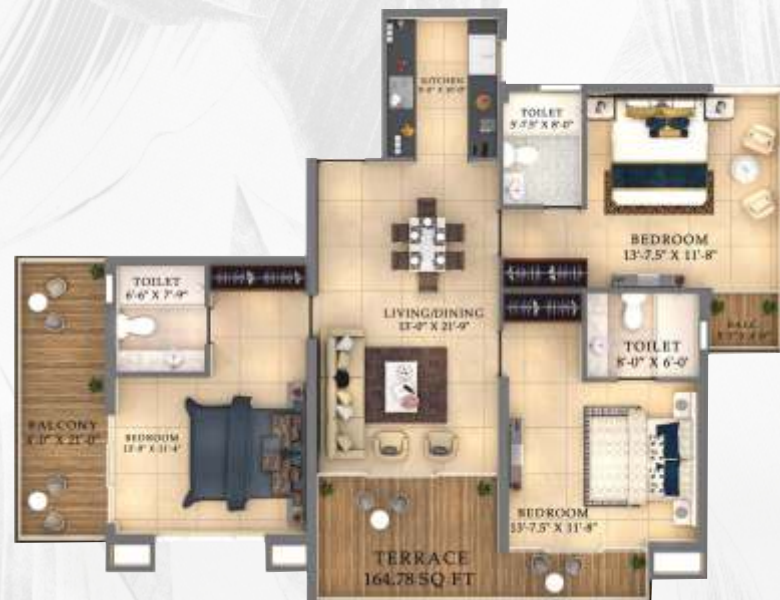
Unit Type 7 Total Area: 1783.12 sq. ft. Built-up Area: 1467 sq. ft. 3 BHK