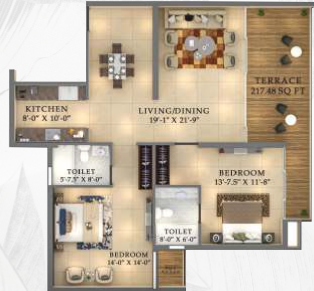
Unit Type 3 Total Area: 1550 sq. ft. Built-up Area: 1268 sq. ft. 2 BHK